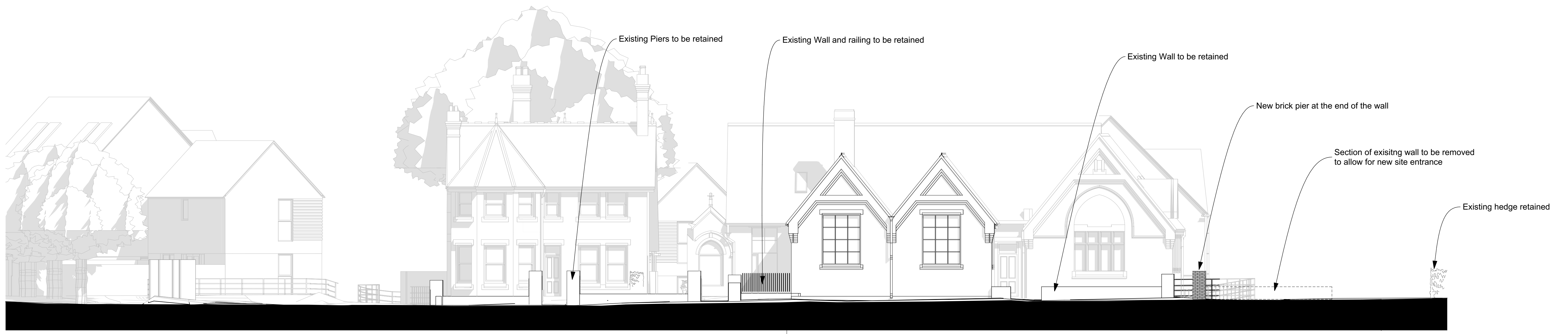
ELEVATION TO MAIN ROAD 1:100